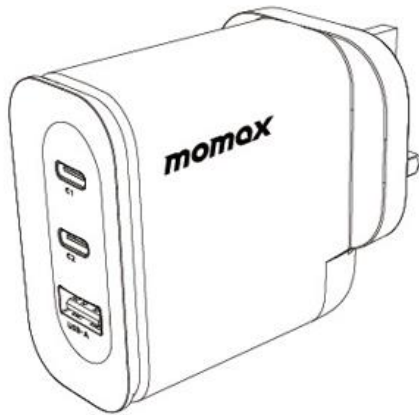
USB-C1/C2 PD Output Port