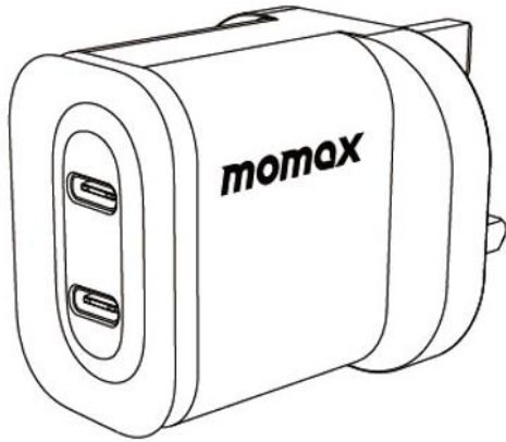
USB-C1/C2 PD Output Port